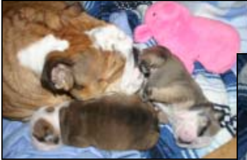
Bella and Pups