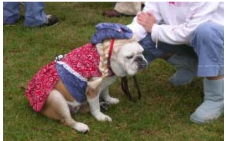
Giddy up, Cowgirl!