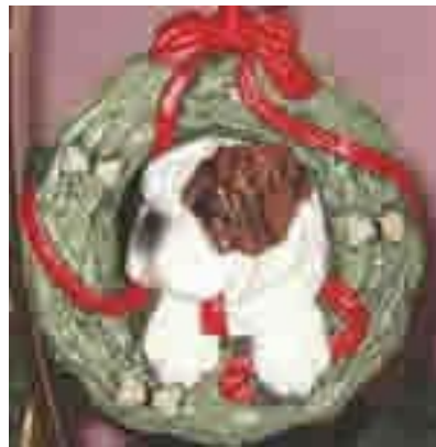
A collection of images off the web resulting from a Google image search for "Christmas Bulldog"