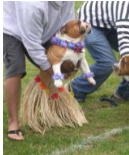
Check out my coconuts!