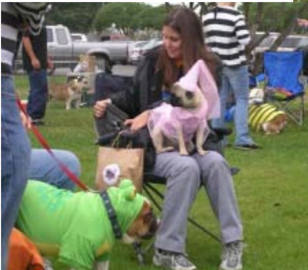
I'm a princess looking for my frog!