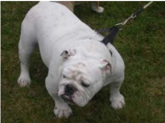
Hercules looking for a home...