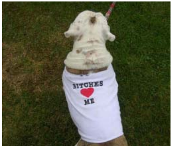
You know it!!!